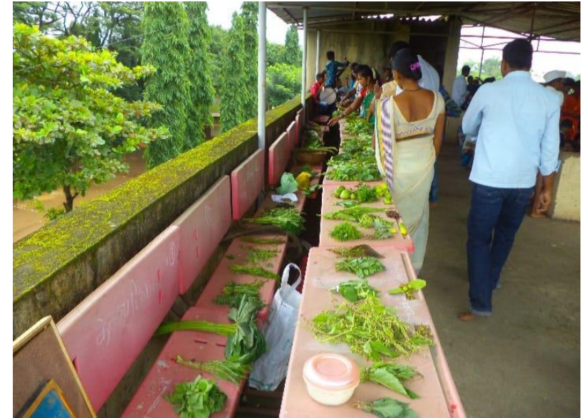
Exhibition of leafy green vegetables