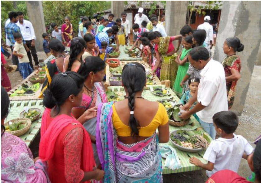
Seasonal wild vegetables and fruits sale