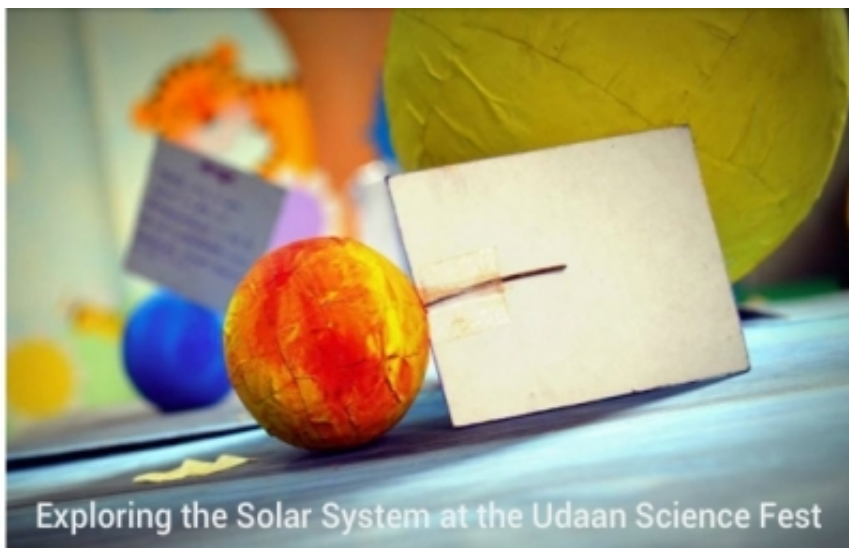
Exploring the Solar System at the Udaan Science Fest